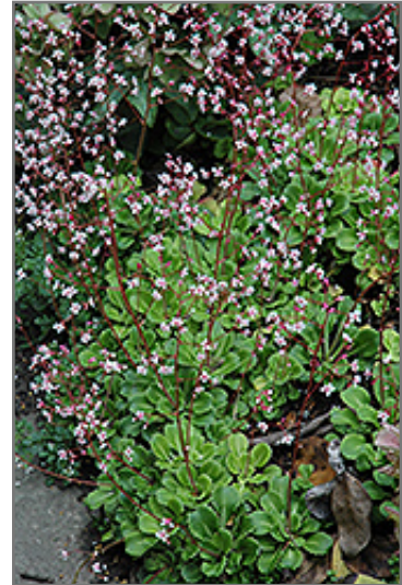
London Pride in bloom