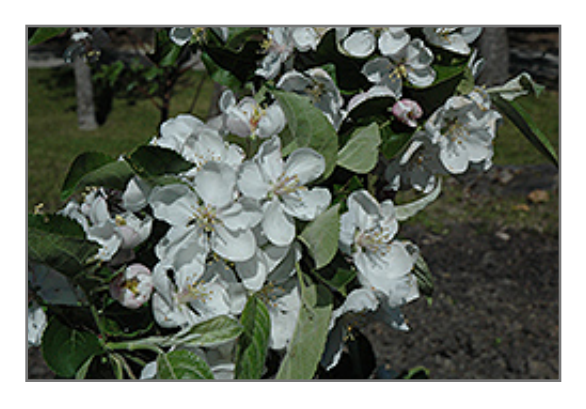
Fall Red Apple flowers

* This is a 'special order' plant - contact store for details