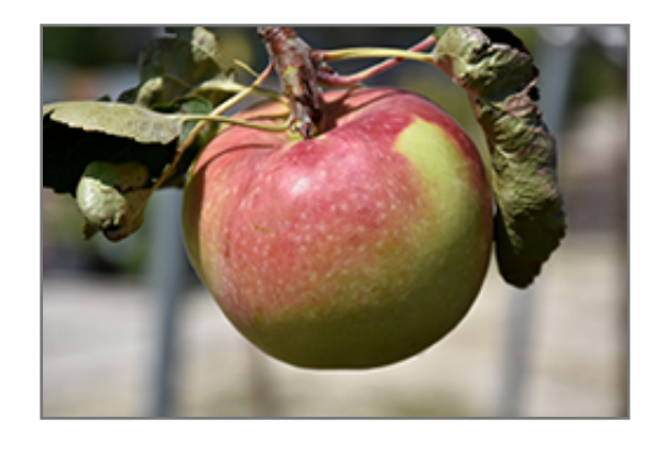
Fall Red Apple fruit

Fall Red Apple features showy clusters of lightly-scented white flowers with shell pink overtones along the branches in mid spring, which emerge from distinctive pink flower buds. It has forest green deciduous foliage. The pointy leaves turn yellow in fall. The fruits are showy ruby-red apples carried in abundance in early fall. The fruit can be messy if allowed to drop on the lawn or walkways, and may require occasional clean-up.