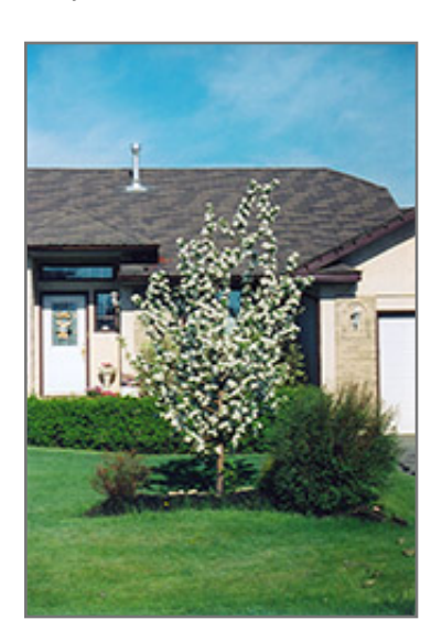
Fall Red Apple in bloom