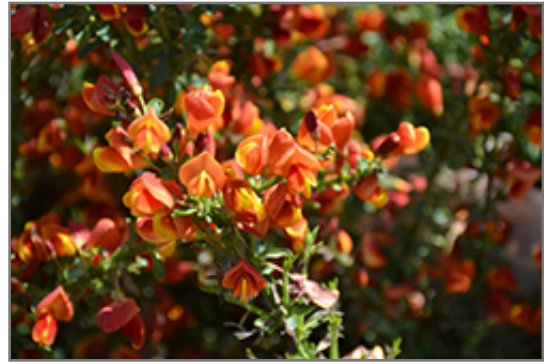
Lena Scotch Broom flowers