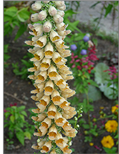
Grecian Foxglove flowers

Grecian Foxglove is recommended for the following landscape applications;