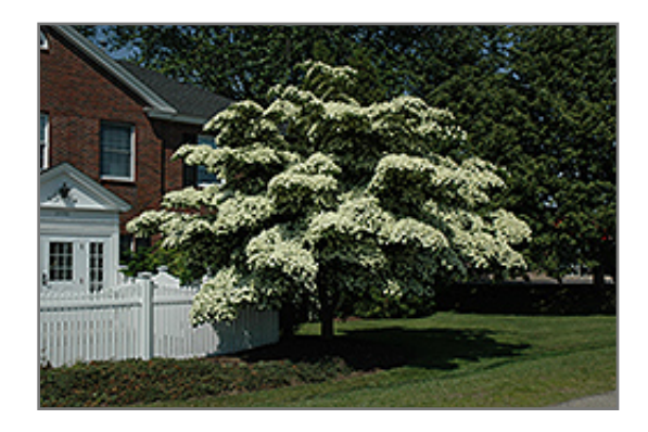
Chinese Dogwood in bloom

This is a relatively low maintenance tree, and should only be pruned after flowering to avoid removing any of the current season's flowers. It is a good choice for attracting birds to your yard. It has no significant negative characteristics.