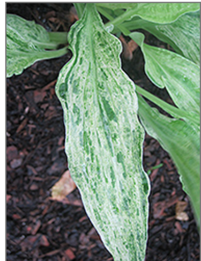
London Fog Hosta foliage