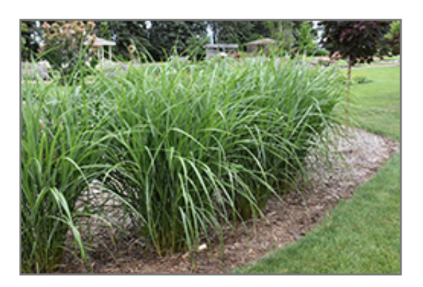
Malepartus Maiden Grass

Malepartus Maiden Grass features bold plumes of shell pink flowers with white overtones rising above the foliage in late summer. Its attractive grassy leaves are green in color. The foliage often turns tan in fall. The silver seed heads are carried on showy plumes displayed in abundance from early fall to late winter.