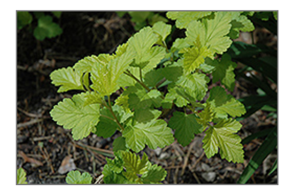
Common Ninebark foliage

361 N. Hunter Highway Drums, PA 18222 (570) 788-4181 www.beechwood-gardens.com