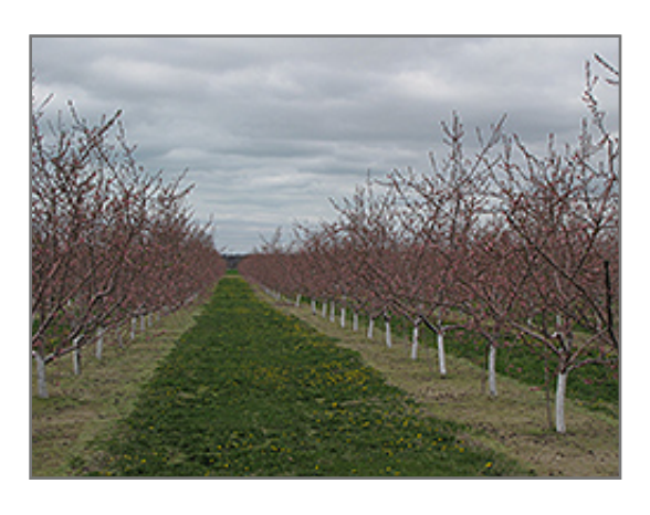
Nectarine in bloom