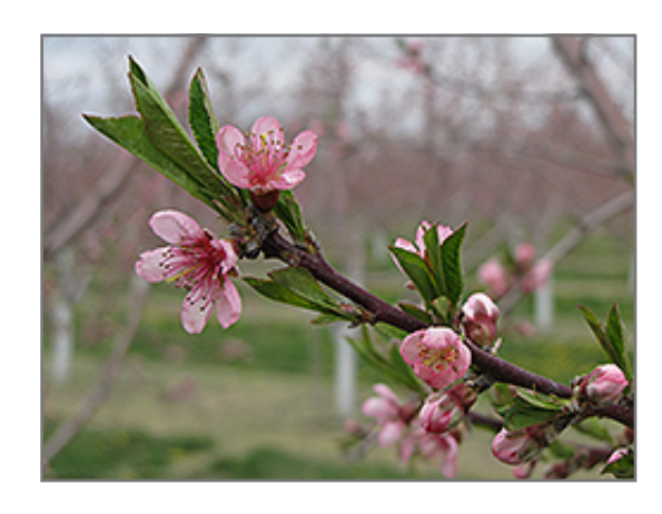
Nectarine flowers

Nectarine is blanketed in stunning clusters of fragrant pink flowers with white overtones along the branches in early spring, which emerge from distinctive rose flower buds before the leaves. It has dark green deciduous foliage. The narrow leaves turn yellow in fall. The fruits are showy red drupes with buttery yellow variegation, which are carried in abundance in mid summer. The fruit can be messy if allowed to drop on the lawn or walkways, and may require occasional clean-up.