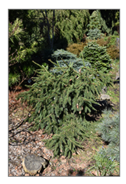
Red Cone Spruce

361 N. Hunter Highway Drums, PA 18222 (570) 788-4181 www.beechwood-gardens.com