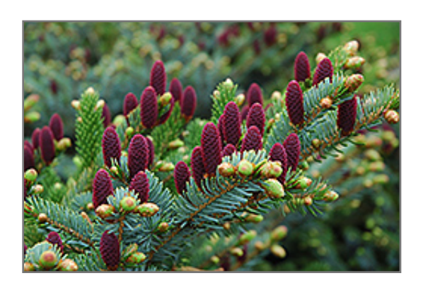
Red Cone Spruce fruit

Red Cone Spruce is recommended for the following landscape applications;