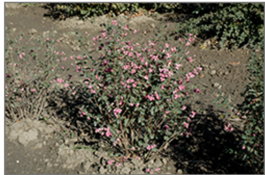
Sweet Snowberry