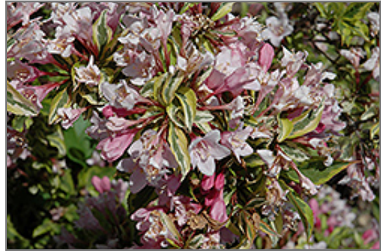
Rainbow Sensation Weigela flowers

Rainbow Sensation Weigela is recommended for the following landscape applications;