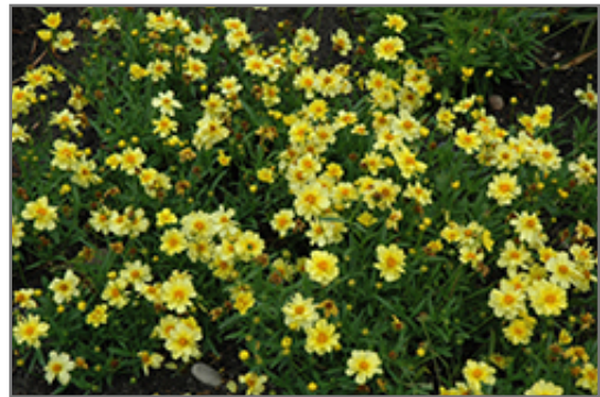
Galaxy Tickseed in bloom