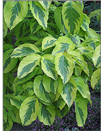
Cherokee Sunset Flowering Dogwood foliage

Cherokee Sunset Flowering Dogwood is recommended for the following landscape applications;