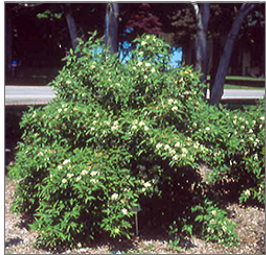
Mahoning Dogwood in bloom