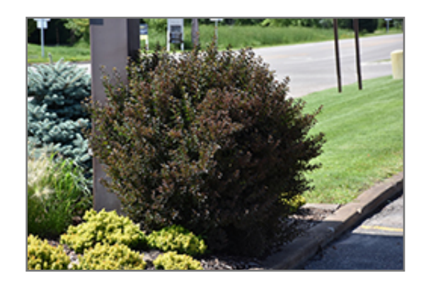
Little Devil Ninebark

Little Devil Ninebark is recommended for the following landscape applications;