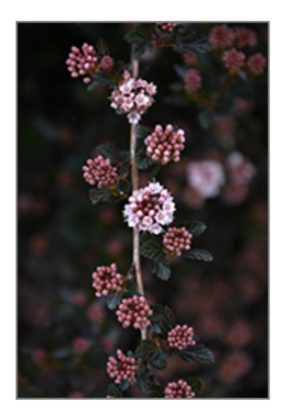
Little Devil Ninebark flowers

361 N. Hunter Highway Drums, PA 18222 (570) 788-4181 www.beechwood-gardens.com