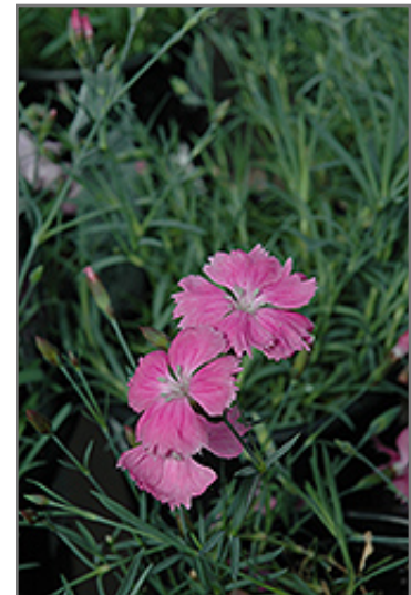
Sweetness Pinks flowers