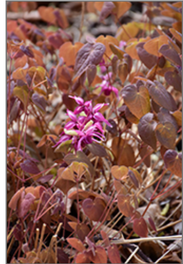
Yubae Bishop's Hat flowers