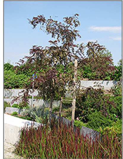
Ruby Lace Honeylocust

* This is a 'special order' plant - contact store for details