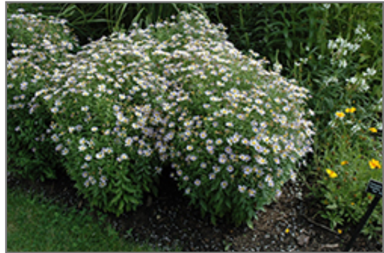
Blue Star Japanese Aster in bloom