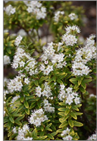
Sand Myrtle flowers

* This is a 'special order' plant - contact store for details