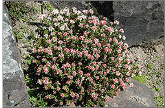
Sand Myrtle in bloom

Sand Myrtle is recommended for the following landscape applications;