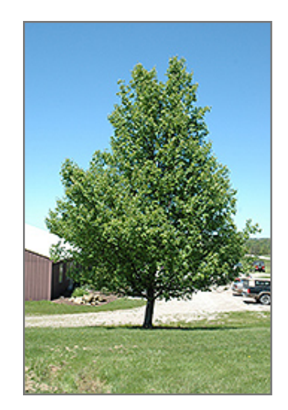
Prairie Gem Pear