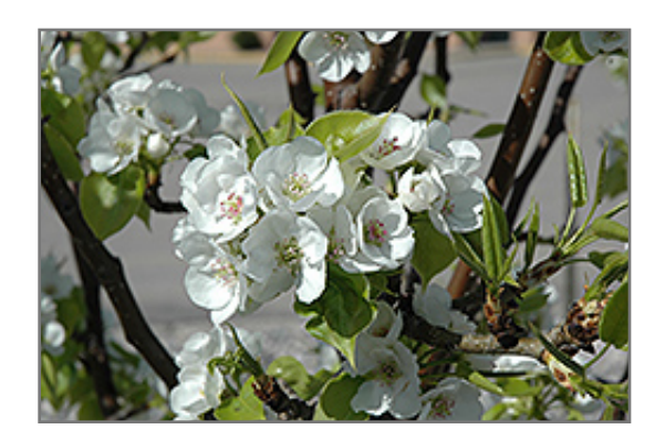
Prairie Gem Pear flowers

361 N. Hunter Highway Drums, PA 18222 (570) 788-4181 www.beechwood-gardens.com