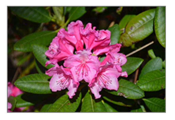
Haaga Rhododendron flowers

A relatively new broadleaf evergreen shrub with rich deep pink flowers in spring, coarse dark foliage and an upright mounded habit, quite hardy; absolutely must have well-drained, highly acidic and organic soil, use plenty of peat moss when planting