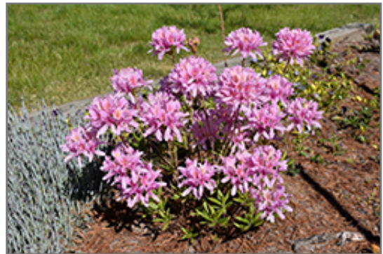
Orchid Lights Azalea in bloom