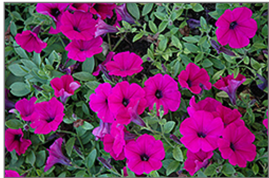
Wave Purple Classic Petunia flowers