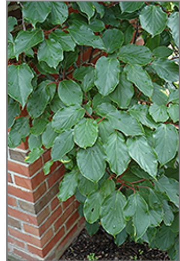
Weiki Hardy Kiwi foliage