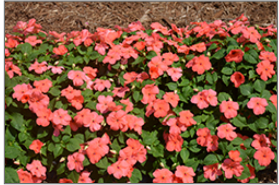
Super Elfin XP Melon Impatiens flowers

Super Elfin XP Melon Impatiens will grow to be about 10 inches tall at maturity, with a spread of 12 inches. When grown in masses or used as a bedding plant, individual plants should be spaced approximately 10 inches apart. Its foliage tends to remain low and dense right to the ground. This fast-growing annual will normally live for one full growing season, needing replacement the following year.