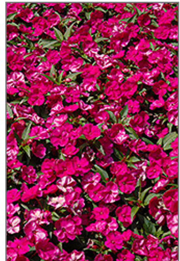
Fanfare Fuchsia Impatiens flowers