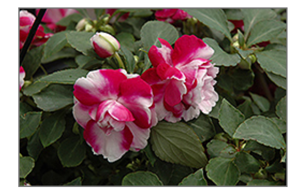
Fiesta Ole Purple Stripe Double Impatiens flowers

361 N. Hunter Highway Drums, PA 18222 (570) 788-4181 www.beechwood-gardens.com