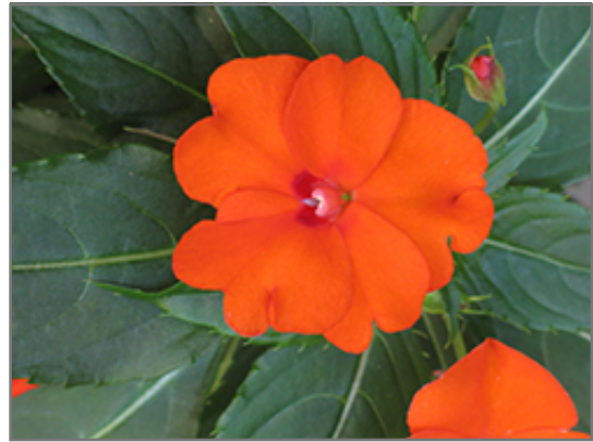
Infinity Orange New Guinea Impatiens flowers

Infinity Orange New Guinea Impatiens is recommended for the following landscape applications;