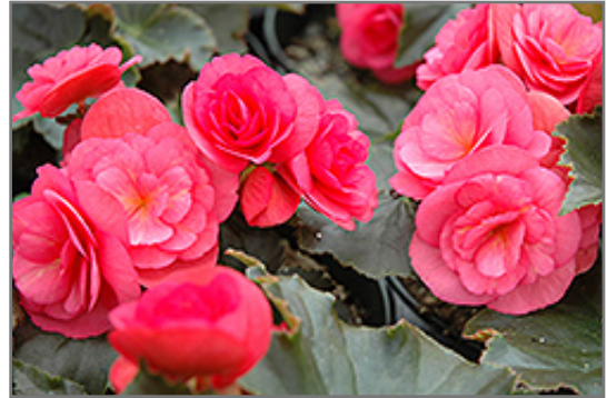
Dragone Begonia flowers

Dragone Begonia is recommended for the following landscape applications;