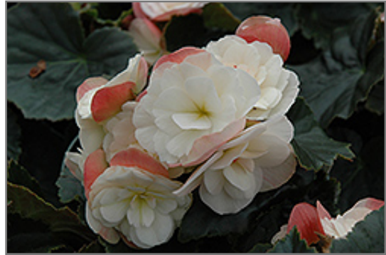
Dragone White Blush Begonia flowers

Hardiness Zone: (annual) Other Names: Hiemalis Begonia Group/Class: Rieger Begonia