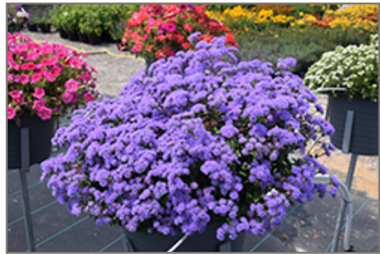
Artist Blue Flossflower in bloom