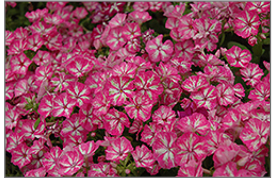
Grammy Pink and White Annual Phlox flowers

Grammy Pink and White Annual Phlox will grow to be about 10 inches tall at maturity, with a spread of 10 inches. When grown in masses or used as a bedding plant, individual plants should be spaced approximately 8 inches apart. Its foliage tends to remain low and dense right to the ground. This fast-growing annual will normally live for one full growing season, needing replacement the following year.