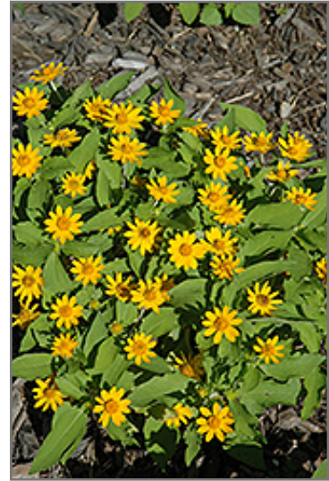
Million Gold Melampodium flowers