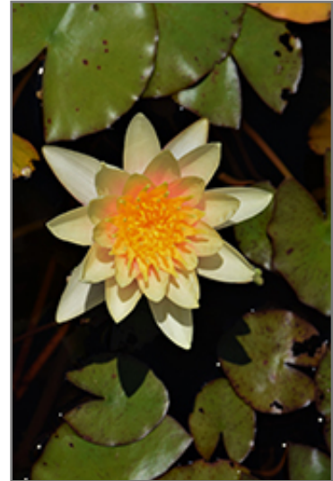
Comanche Hardy Water Lily flowers