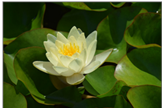
Marliacea Chromatella Hardy Water Lily flowers