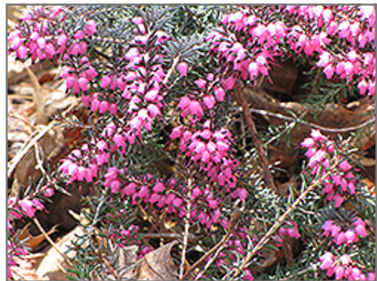
Spring Heath flowers