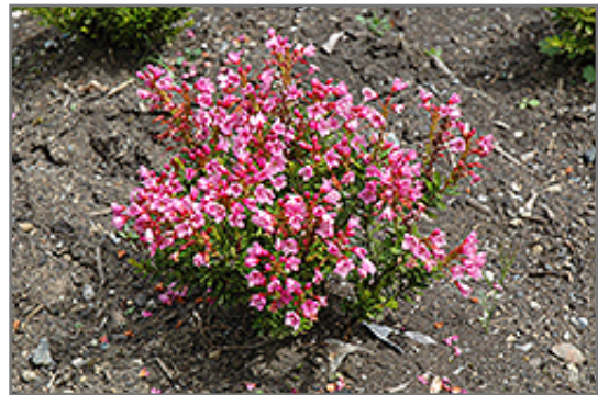
Coppelia Phylliopsis in bloom