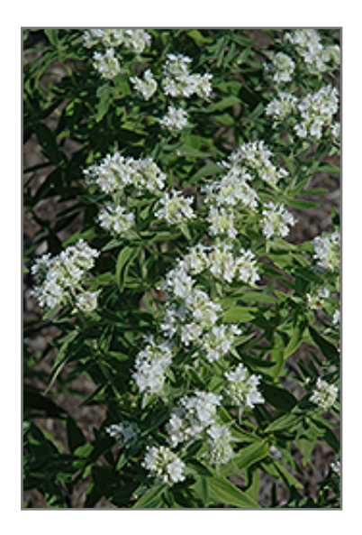
Hairy Mountain Mint in bloom

361 N. Hunter Highway Drums, PA 18222 (570) 788-4181 www.beechwood-gardens.com