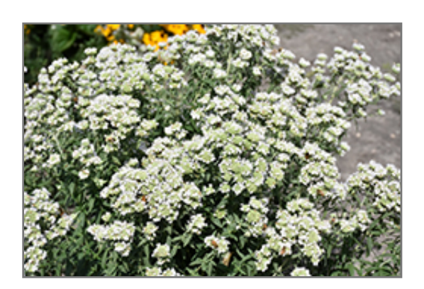
Hairy Mountain Mint flowers

Hairy Mountain Mint is recommended for the following landscape applications;