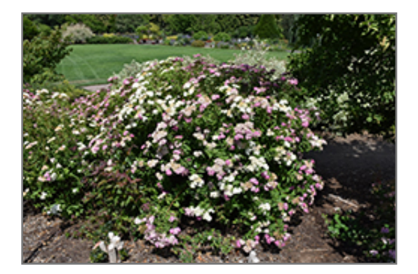
Shirobana Spirea in bloom

Shirobana Spirea is recommended for the following landscape applications;