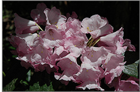
Silverleaf Rhododendron flowers