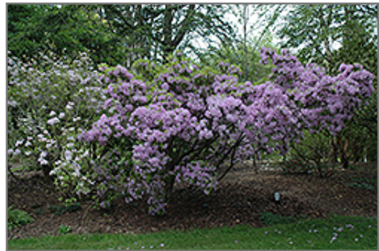
Yunnan Rhododendron in bloom