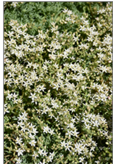
Dwarf Spanish Stonecrop flowers