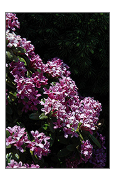
Collina Daphne flowers