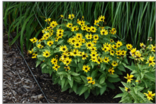
Sunburst False Sunflower in bloom