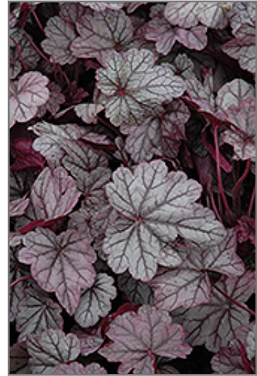
Carnival Sugar Plum Coral Bells foliage

This is a relatively low maintenance plant, and should be cut back in late fall in preparation for winter. It is a good choice for attracting hummingbirds to your yard. It has no significant negative characteristics.