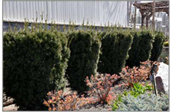
Hicks Yew

This shrub performs well in both full sun and full shade. However, you may want to keep it away from hot, dry locations that receive direct afternoon sun or which get reflected sunlight, such as against the south side of a white wall. It does best in average to evenly moist conditions, but will not tolerate standing water. It is not particular as to soil type or pH. It is highly tolerant of urban pollution and will even thrive in inner city environments, and will benefit from being planted in a relatively sheltered location. Consider applying a thick mulch around the root zone in winter to protect it in exposed locations or colder microclimates. This particular variety is an interspecific hybrid, and parts of it are known to be toxic to humans and animals, so care should be exercised in planting it around children and pets.