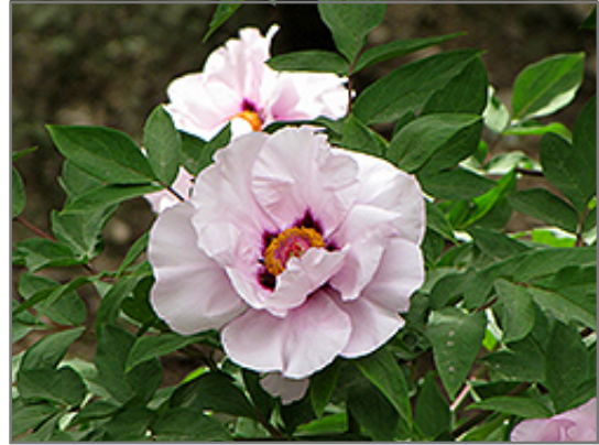
Dai Yu Tree Peony flowers

Dai Yu Tree Peony is recommended for the following landscape applications;