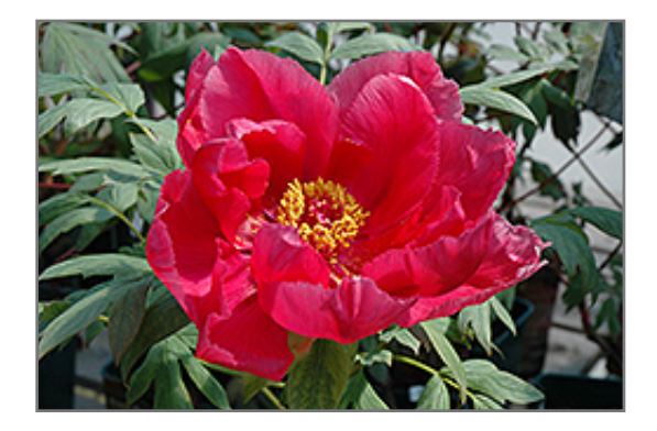
Naniwa Nishiki Tree Peony flowers

361 N. Hunter Highway Drums, PA 18222 (570) 788-4181 www.beechwood-gardens.com